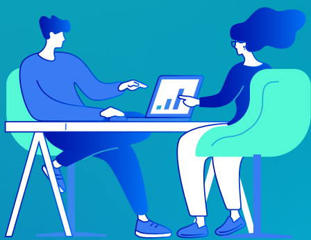
COORDINATION CENTER of TLD .RU and .РФ